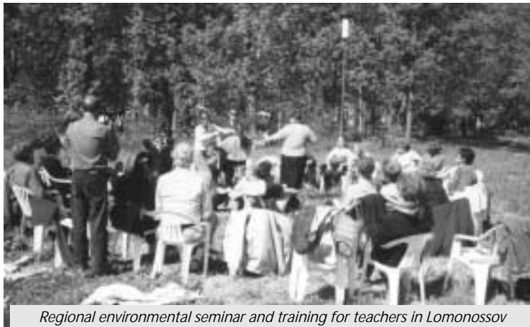
Regional environmental seminar and training for teachers in Lomonossov

This network joins teachers, schoolchildren, students and other residents of coastal areas around the Gulf of Finland in Saint Petersburg and Leningrad region. Four local information centers in Lomonosov, Kipen, Sosnovy Bor and Primorsk were equipped by the NGO Children of the Baltic with computers and free e-mail service to provide province teachers access to information and promote local and regional co-operation.