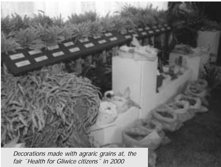
Decorations made with agrarian grains at the fair "Health for Gliwice citizens" in 2000

In 1998, with this aim in mind the Polish Ecological Club (PKE) initiated the Coalition to Support