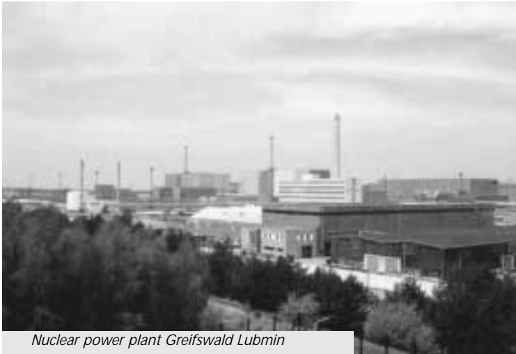
Nuclear power plant Greifswald Lubmin

The present situation is far from reaching this goal. At present, one of the biggest interim storage for nuclear waste in Europe and a plant for processing nuclear mud are located in the area of the former power plant. These facilities were projected to be used only for the waste of the old Greifswalder Bodden power plant, but the actual capacities reach considerably higher levels.