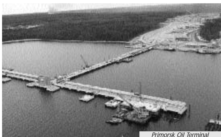
Primorsk Oil Terminal

As to the fish fauna, the area of Beryozovy Islands is considered to be one of the most favored spawning sites for important commercial fish species, namely for Baltic herring ( Clupea harengus membras ), white fish ( Coregonus lavaretus ), and sport fishing species such as perch, pikeperch and others.